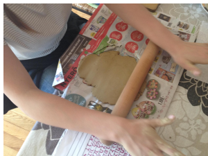
step 2 - 3