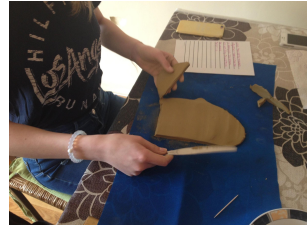
step 4 - 5